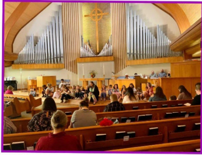
Children's Sermon For PCC 50th Anniversary