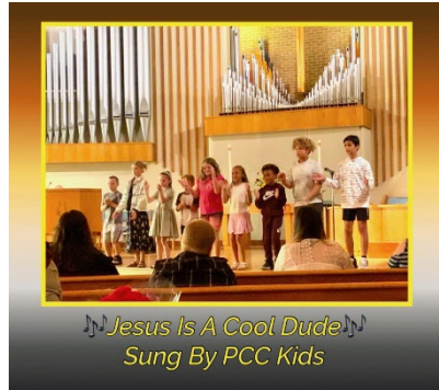
♪♪ Jesus Is A Cool Dude ♪♪ Sung By PCC Kids