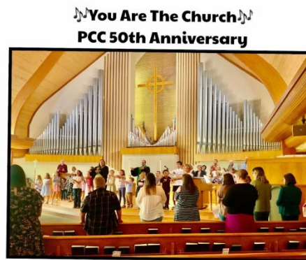
♪♪ You Are The Church ♪♪ PCC 50th Anniversary