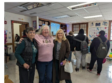
W. High School Holiday Store